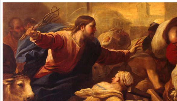
Expulsion of the Money-Changers from the Temple, 1675, Luca Giordano

Today's Readings: Ex 20:1-17; Ps 19:8, 9, 10, 11; 1 Cor 1:22-25; Jn 2:13-25